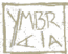
Literature web-magazine www.yambria.org