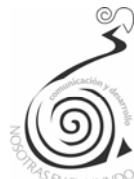
We in the World Network www.rednosotrasenelmundo.org