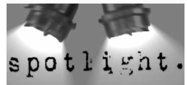
St Andrews Creative Writing Soc http://www.st-andrews.ac.uk/english/spotlight